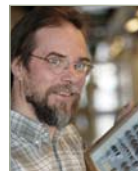
Prof. Ilkka Hanski

National Institute of Advanced Industrial Biology and Technology, Japan